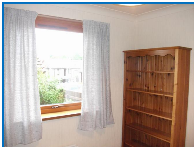
BEDROOM 3 (2.49m x 2.65m) Window to rear, radiator, carpeted flooring and storage cupboard.