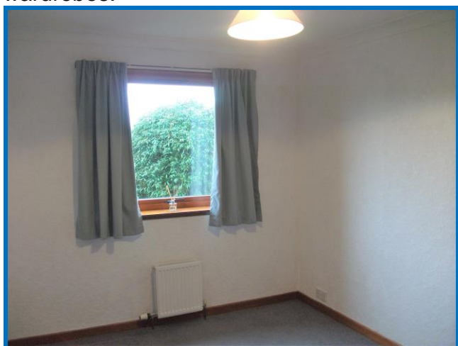
BEDROOM 2 (4.15m x 2.83m at it longest) Large double bedroom with window to rear, radiator, carpeted flooring, built-in wardrobes