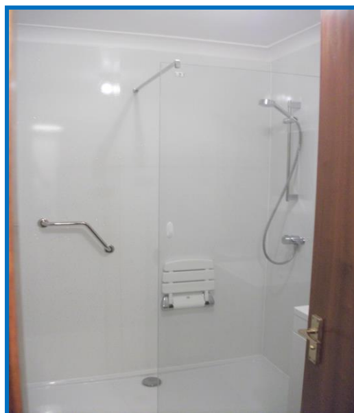
SHOWER ROOM (2.30m x 1.70) Walk in shower, WC and sink with vanity unit. Radiator, vinyl flooring.