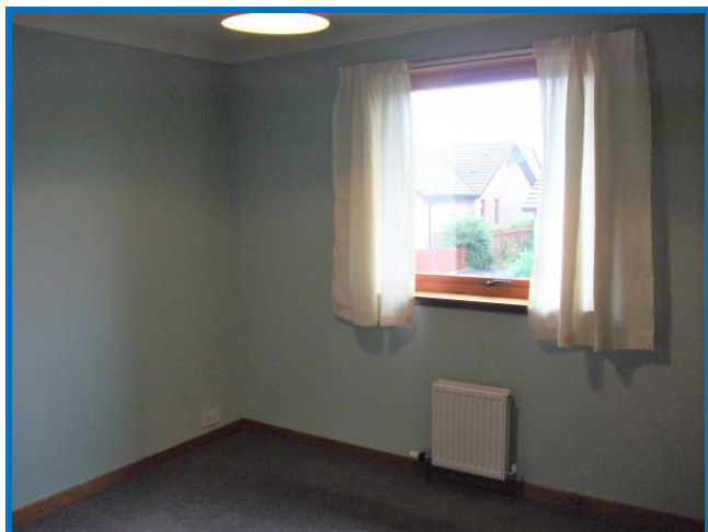
BEDROOM 1 (3.23m x 2.84m) Double bedroom with window to side, radiator, carpeted flooring, built-in wardrobes.